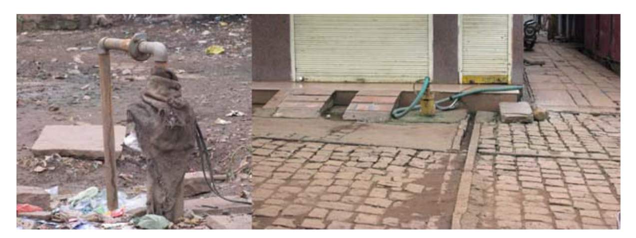
Existing water sources - Tubewell in Shivpuri

The water distribution lines in the town exist only in the old town areas and people living in newly developed colonies face problems with water supply due to lack of distribution network. Water supplied through piped arrangement in mostly old areas using the overhead tanks while newly developed colonies and areas outside the city are provided with supply using direct pumping from tubewells. Other remaining areas are provided with handpumps. Water is supplied zone wise and most connections get water supply for a maximum period of 30 minutes every alternate day in winters. The supply in summers is once in 3-4 days.