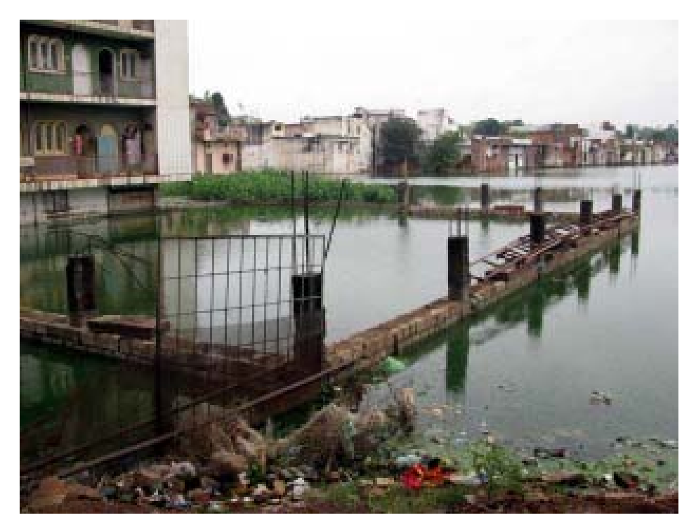
Local water sources - being encroached

government and also the personal systems built by local residents including community based water resources and supplies. Under this clause the private company shall have the right to ban the use of water from personal tubewells, dugwells, handpumps, tanks, etc. This is a step further in securing the rights and more importantly the profits of the private concessionaire at the cost of the lives and livelihoods of the local residents, ignoring and severely impacting the socio-cultural-traditional aspects of the local populace.