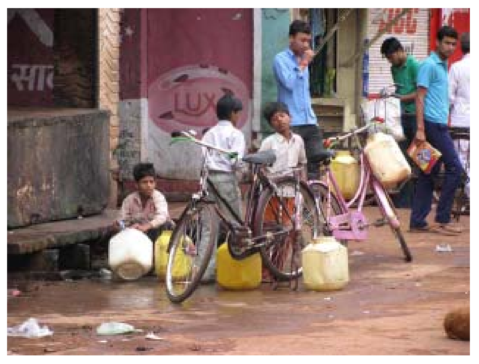
Water supply - from public standposts

The concession contract mentions that in the case of public stand posts and in slum areas the following shall be applicable - "All public stand posts shall be disconnected from the Commercial Date of Operation (COD). The affected persons shall be motivated for taking individual/ group connections. Group connections shall be for apartments/ tenants up to 10 households. One of the consumers shall be chosen as the group leader who shall be responsible for