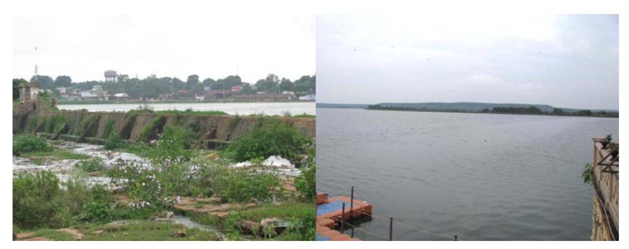
Existing water sources - Jadhav Sagar and Madhav Sagar

Despite the fact that the tubewells are deep the water level is going down every year. The supply from almost 50% of the tubewells goes to zero during peak summer months. There are around 177 handpumps in the town, but majority of these also go dry during the summer months.