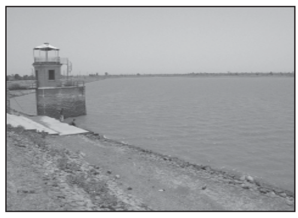
Still dependable: Nagchun tank built in 1897

Generally, it is understood that irrigation canals are operated in the dry season, so that additional crops can be harvested apart from the wet season. However, with respect to the above mentioned project, the Narmada Valley Development Authority (NVDA)