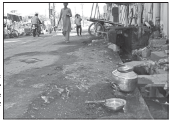
No public in PPP: People living in town were not consulted.

One of the significant reasons given for operating the new water supply project as a PPP project is that the municipal corporation is not able to recover the expenses incurred on the water supply system. The funds meant for other heads have been spent on water supply and consequently the development of the town gets hampered. However, handing-over of water operations to a private company would not make a positive difference to the situation. The only difference would be that the expenses on water supply would increase many fold and that this expenditure would either be recovered from the residents or subsidised by KMC and these funds would go into the coffers of the private company.