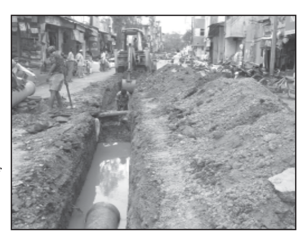
Slow pace of work: ongoing work in the town.

For example, if we consider the service area aspect - under