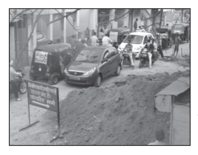
Ongoing project work: locals facing poor traffic conditions.

In case of a disagreement on the billed amount for water supplied/consumed, the residents would be required to pay the full billed amount first. Later on, if the complaint is found to be valid,