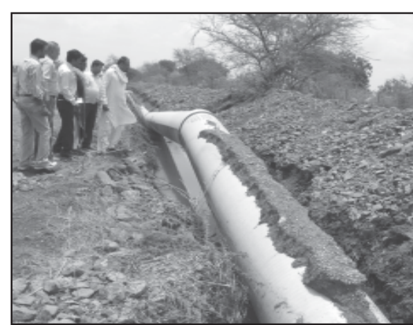
Bulk water pipeline: yet to start water supply

The municipal council has also accepted in its proposal in the Khandwa Municipal Council general assembly dated - 31st March 2008 that the staff of the water supply department is not trained to operate the new water project. This was one of the main arguments given by KMC for the implementation of new water project by a private company through PPP mode.