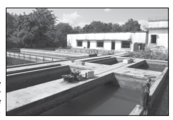
Would be neglected: Filter plant at Jaswadi.

The data available with the KMC shows that out of the total water supplied to the town 61% is from Bhagwant Sagar Project, 31% from the ground water sources and the rest comes from Nagchun Tank.<sup>6</sup> Currently, the town needs 29 mld water based on 135 lpcd water supply. However KMC is able to provide 15-19.5 mld water for distribution, depending on the season, rainy - summer, the water deficit is in the range of 8-14 mld. The municipal corporation claims that it is supplying water to 80% of the town. But large residential colonies like Vatsala Vihar, Ram Nagar, Kishore Nagar are not connected to municipal water system. Around 15 wards in the town do not have piped water supply, in these wards water is distributed using water tankers.<sup>7</sup>