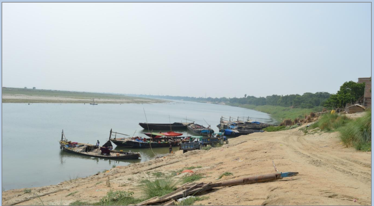
(Proposed Kalughat Intermodal Terminal Site on Ganga (NW-1) near Patna. This terminal will be developed to handle container cargo, exclusively for Nepal.)

A Preliminary report from Manthan – <u>National and International Inland Waterways in Kosi and Gandak rivers</u> explains the provisions, problems and potential of extending these waterways into Nepal.