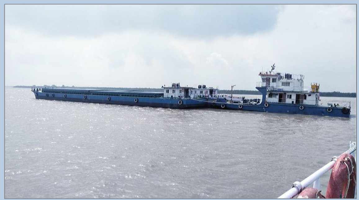
(IWAI vessel bound for Pandu Port (Guwahati, Assam) carrying 1233 tons of Fly-Ash from NTPC plant (Kahalgaon,Bihar))

NW-1,2,3,4,5 and 6 to National/ State Highways, Railways (wherever feasible) and Sea Ports (wherever feasible) so that all these waterways become an integral part of the total transportation grid. Integrated movements of bulk goods like fly-ash and coal through NW-1(Ganga-Bhagirathi-Hooghly) and NW-2 (Brahmputra) through Indo-Bangladesh Protocol route (part of NW-97 on Sunderbans) have been initiated by the IWAI.