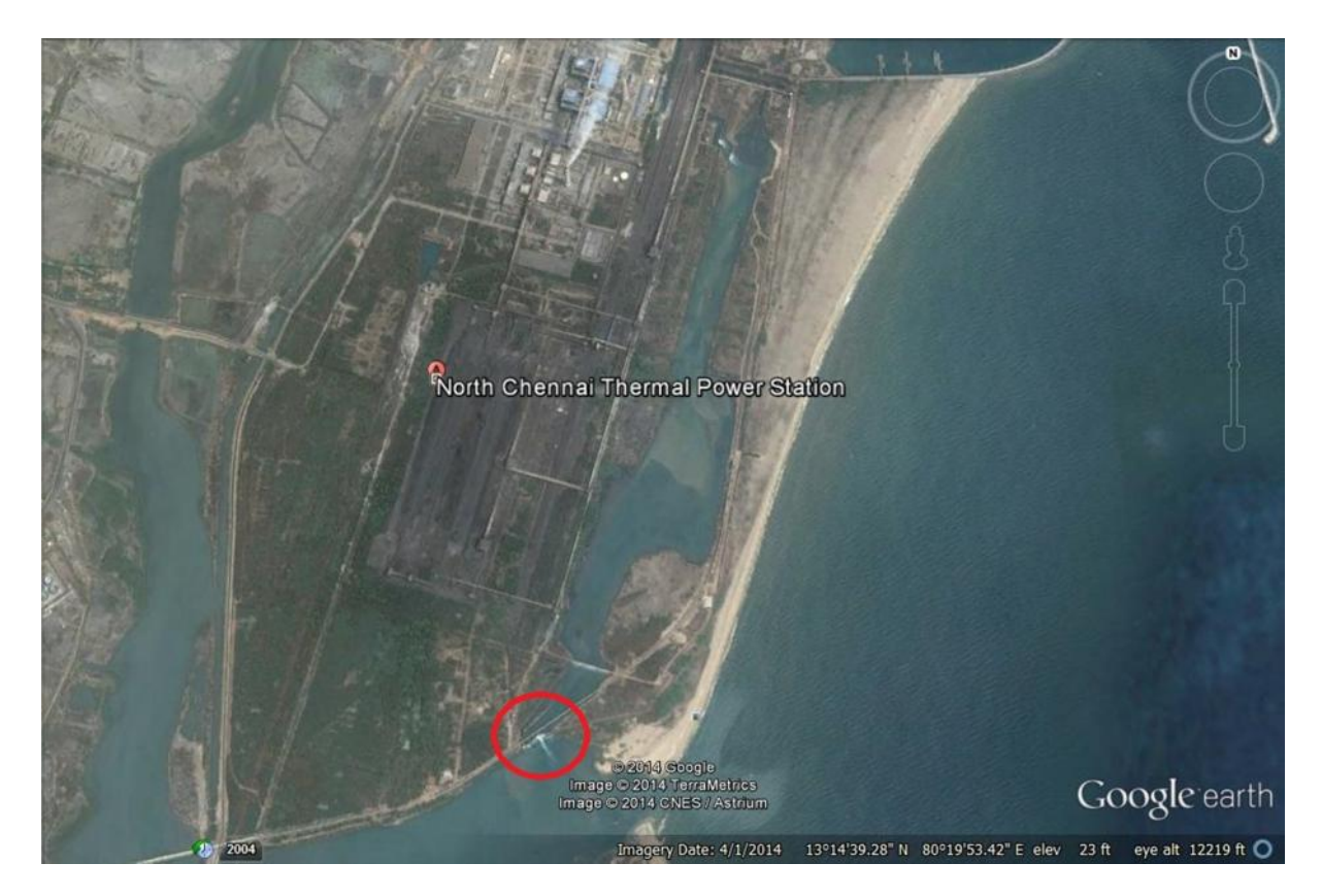
Figure 11: Google Earth image showing discharge of water from compound wall of North Chennai thermal power station into Ennore Creek.