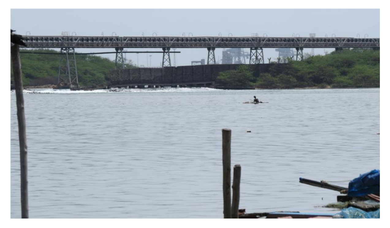
Figure 12: Photograph of the actual site marked in Google Earth image above, showing water discharge from boundary wall of North Chennai thermal power station into Ennore creek opposite Mukhdwarkuppam village.

Similar is the case with village Gummaldibba (and others), near the Krishnapattanam port in Nellore district in AP. Gummaldibba (in Chillakuru block of Nellore district in Andhra Pradesh) is a village where all the families are dependent on fishing, particularly in the Kandeleru creek. Yet, their