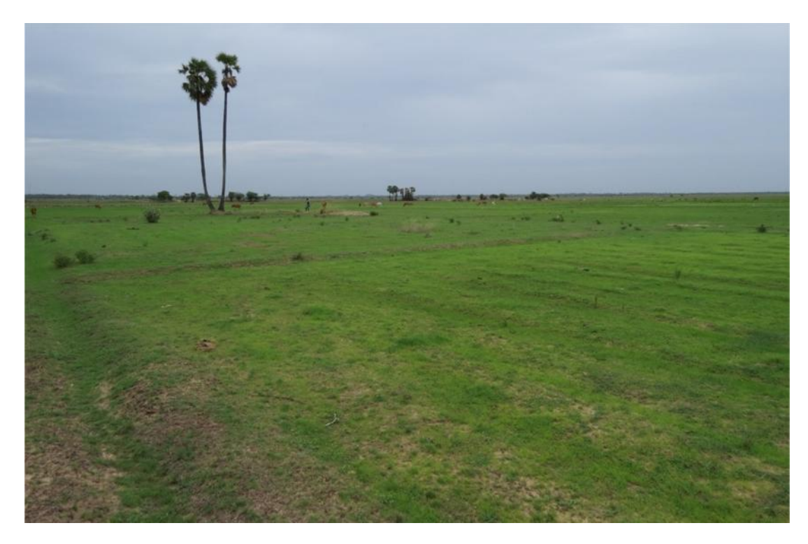
Figure 8: Photograph showing agricultural and grazing land at the site of upcoming Cheyyur UMPP project.

The proposed 4000 MW Cheyyur thermal power plant to the south of Chennai is a perfect example of this threat. The Cheyyur plant is located about 5 kms from the coast, in the middle of very good agricultural land, grazing land and abundant freshwater sources in the form of cascade systems of tanks.