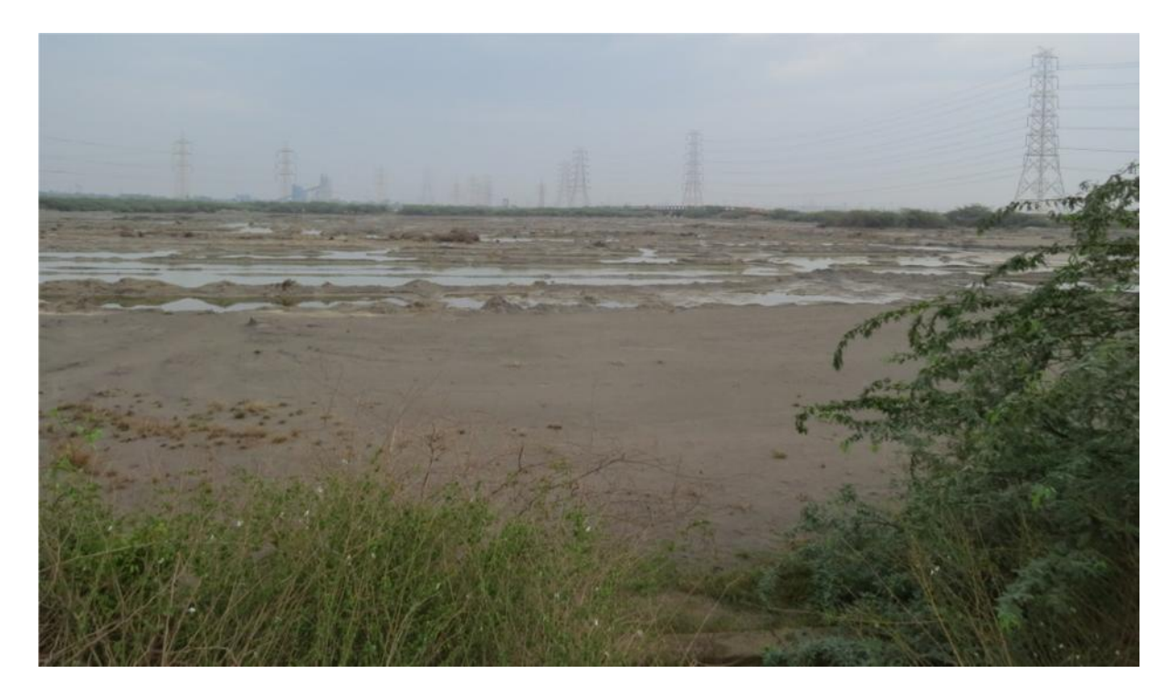
Figure 5: Photograph showing ash from North Chennai thermal power station dumped in marshy lands around river Kortaliyar

The 1440 MW Mettur TPS (it is not a coastal plant, but was covered in our visit) allows the decant of its ash pond to flow directly into the local water bodies. This decant carries lots of ash, which is contaminating the fields, and ultimately the Cauvery river into which the local water system drains.