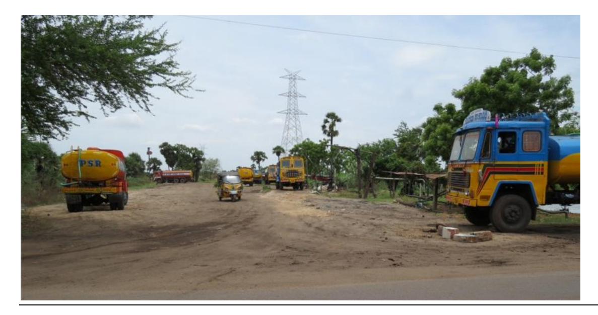
Figure 22: Photograph showing water supply tankers being filled by bore well pumps at Muthukur near Krishnapattanam port.