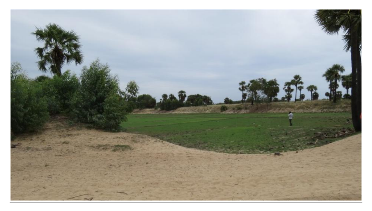
Figure 16: Photograph showing sand dunes protecting fields near the site of upcoming Cheyyur thermal power project.

Many of the coastal plants use conveyor belts to carry the coal from the port to the plant. These conveyor belt systems can also disrupt local ecosystems. For e.g., in the case of the Cheyyur TPP, the 5 km long conveyor belt is likely to cut through many old sand dunes. These sand dunes are a veritable ecosystem by themselves. They support a rich diversity of crops including commercially important ones like cashew. The sand dunes act like sponges, storing fresh water during rain and providing it to the different crops and trees rest of the time. In this way, apart from the trees, these sand dunes also support rich paddy crops. They also provide these paddy fields protection in the coastal areas. This rich dune ecosystem is found even very close to the coast.