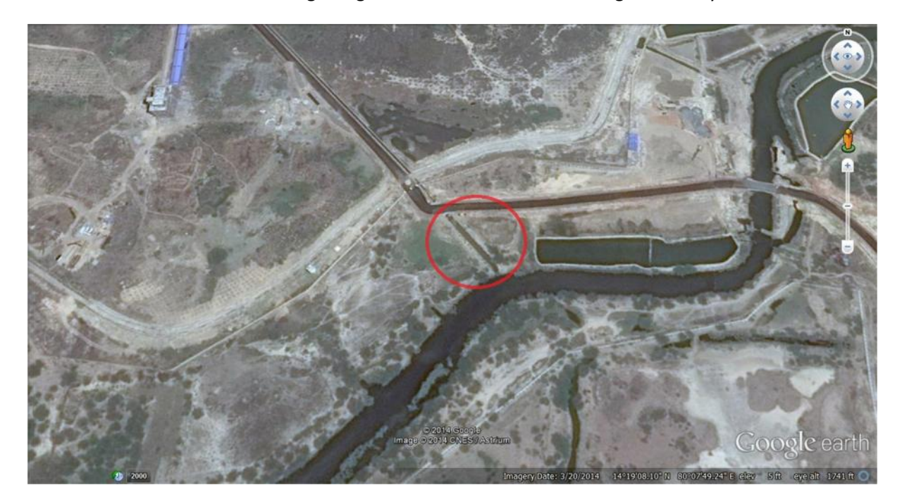
Figure 1: Google Earth image showing waste water channel coming out (circled) from APGENCO plant and meeting an irrigation canal. We found dead fish in large quantities in this waste water channel.

For this, it has a large waste water disposal channel. But it is clear that this channel does not always carry treated water, and contaminated water is 'escaping' from this channel. When we visited the plant, we found large number of dead fish in the channel indicating contaminated water. What is more problematic is that this waste water channel empties directly into a local irrigation canal. Thus, the contaminated waste water is getting into the external water and agriculture system.