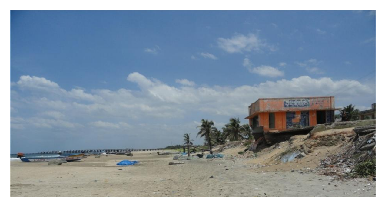
Figure 15: Photograph showing damaged PDS shop due to sea Erosion at Petode village in Tamilnadu

We also noted the coastal erosion at several villages we visited; for example in village Petode of Koylapat Panchayat in Kurunjpadi the children's play garden developed during Tsunami relief works has been destroyed, and continuing erosion has led to abandonment of the PDS shop built there. To the south side of village is the under construction site of Nagarjuna Jetty and intake well with port of the 4000 MW IL& FS thermal power station .