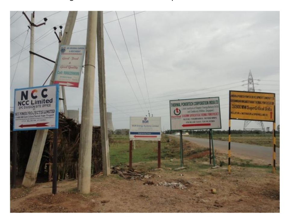
Figure 23: Signboards near Nellore showing a number of thermal power plants coming up in close vicinity. Seen in the distance are cooling towers of another plant.

Serious as the impacts of individual plants are, the cumulative impacts of several plants coming up in clusters are much higher. In many places, including places we visited like Nellore district, North Chennai, Cuddalore, there are such clusters coming up. Unfortunately, there is no cumulative impact assessment being undertaken of such development<sup>21</sup>.