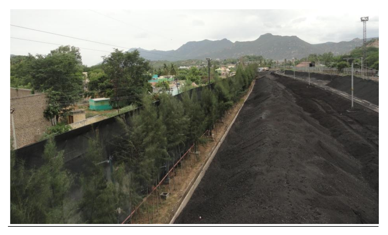
Figure 19: Photograph showing 'green cover' and protective cloth at coal yard of MALCO and Chemplast at Mettur in Tamilnadu.

The problems persist in spite of the measures taken to restraint the spread of coal dust pollution – a so called green cover, some cloth that is torn in several places and a high boundary wall of metal sheets.