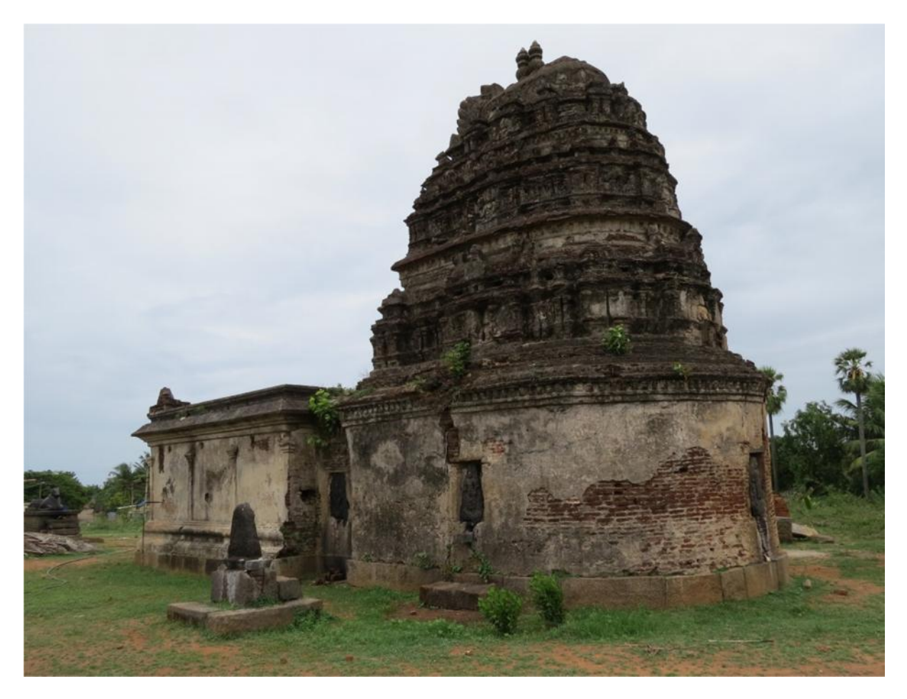
Figure 10: Photograph showing temple dating back to 10<sup>th</sup> Century, on the bank of Vedal Eri,.

The report also highlights how the proposed storm water drain cuts through local drainage channels, and will disrupt the freshwater flow into several water bodies, in particular the Odiyur lagoon. This decrease in freshwater flow into the lagoon will change its balance towards increased salinity, and have serious implications for its biological productivity that also supports a large migratory bird population and rich local fisheries.