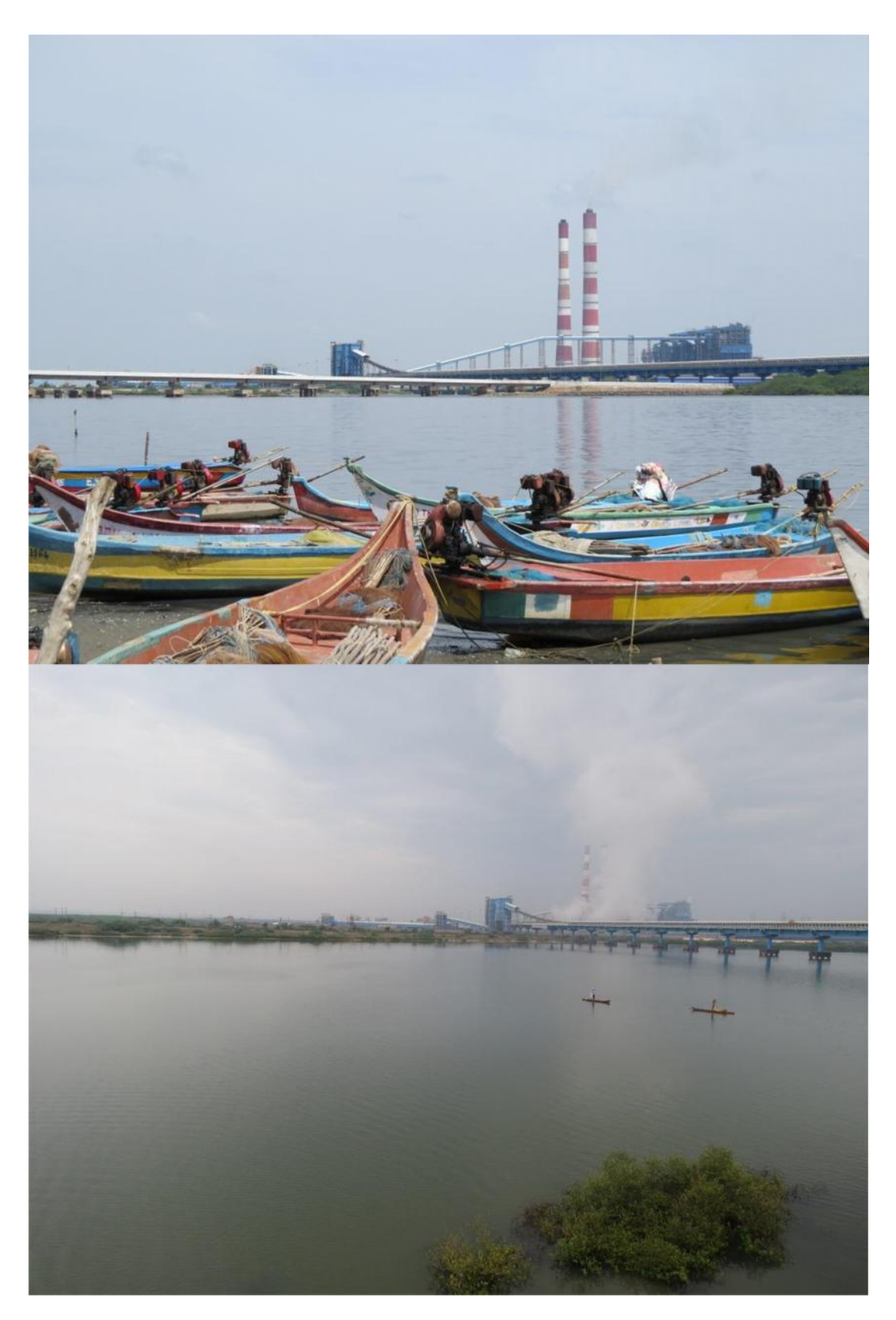
Impacts of Coastal Coal Based Thermal Power Plants on Water Report of Visit to Some Operational and In Pipeline Plants in Andhra Pradesh and Tamil Nadu Manthan Adhyayan Kendra October 2014