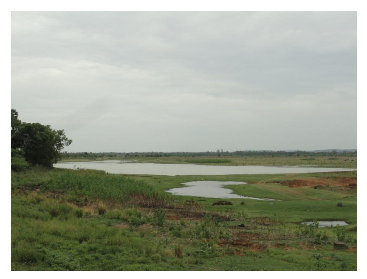
Figure 9: Photograph showing Vedal Peria Eri, just at the beginning of the monsoon. A careful look at the middle of the photo on the right hand side will show a few bullock carts using the pre-monsoon dry eri as a path, giving an idea of the size of the eri.

supporting rich agriculture and fisheries, but are of historical, social and cultural importance, with some of them thought to be going back to the 10<sup>th</sup> Century<sup>13</sup>.