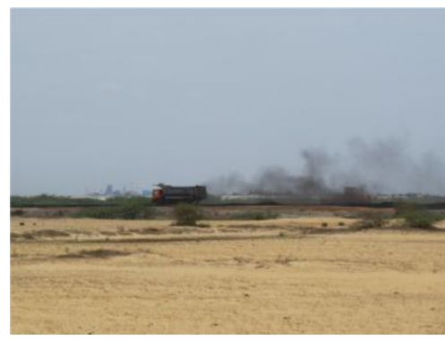
Figure 18: Photograph showing Krishnapattanam port, coal dumps and transporting lorries. Smaller picture shows dust spreading due to coal handling.

It is interesting that the Environmental Clearance for the Krishnapattanam Port Phase 2 dated 13 Nov 2009 (we were not able to get the EC letter for Phase 1), has a condition that "The greenbelt of 100 m. width shall be developed around the coal stack yard as per the request in the public hearing". A Monitoring Report of the Port by the Regional Office, Southern Zone of the MoEF was carried out on 5 Nov 2013, which noted almost full compliance with all conditions, including that the green belt of 211.5 ha was developed when at end of Phase 2 only 191.5 ha. However, as the photograph in Figure 18 above shows, there does not seem to be any green belt around the coal yard.