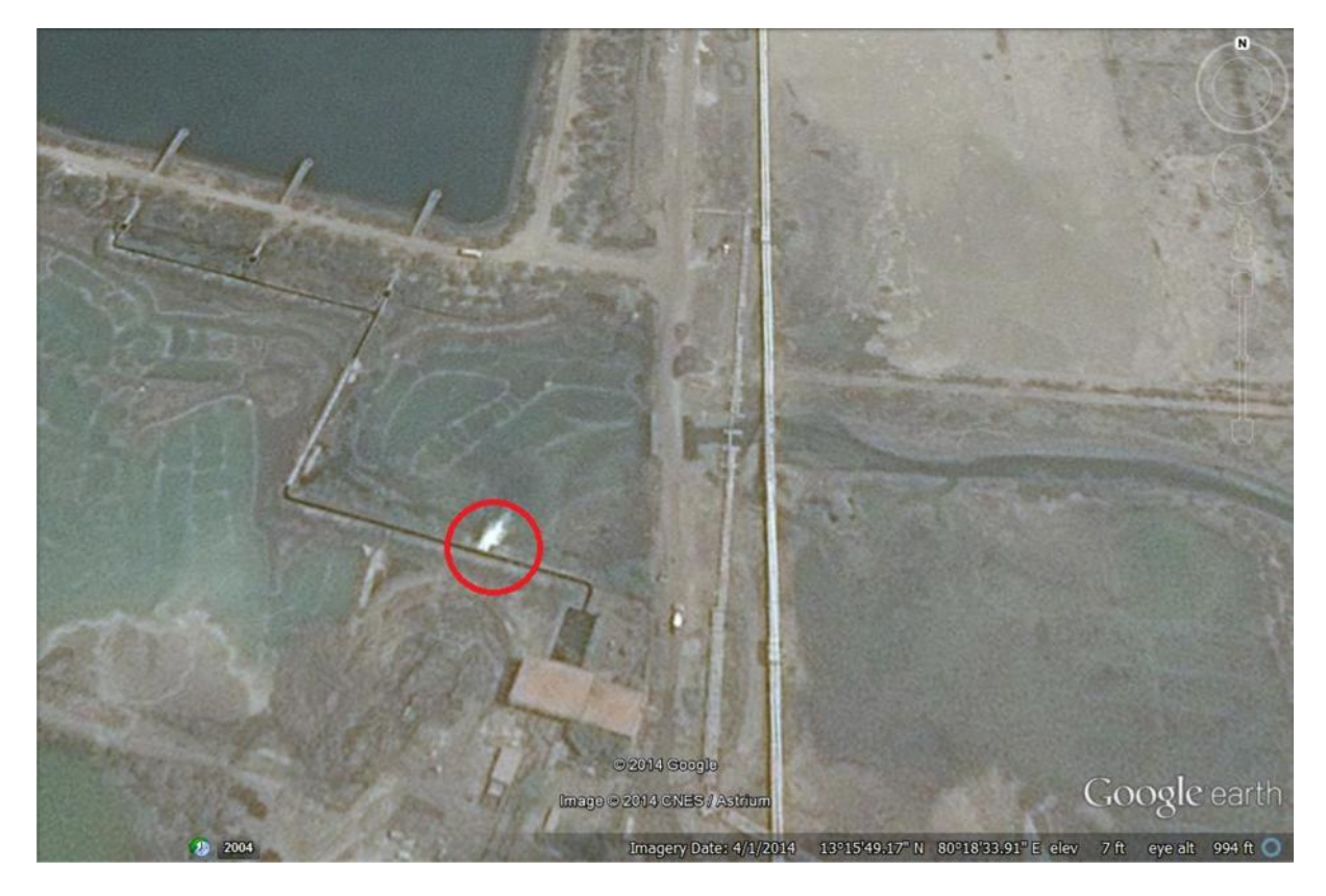
Figure 3: Google Earth image showing ash water leakage from ash water recirculation system of North Chennai Thermal Power Station into the local water body.

In fact, since ash has these toxic elements, environmental clearances for coal power plants require proper protection including lining the bed of ash ponds to make sure that ash doesn't enter local water bodies and water systems<sup>8</sup>. However, we saw copious of amounts of water pouring out of the ash water recirculating system of the 630 MW North Chennai TPP . This was the ash slurry decant (the water left after ash partly settles down; the decant can also carry fair amounts of ash and pollutants).