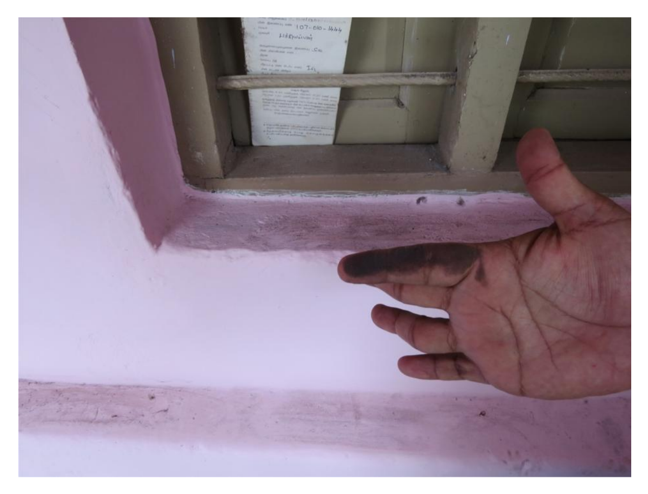
Figure 20: Photograph showing finger blackened with coal dust, after swiping on window sill, at Green Park Residential area in Mettur, Tamil Nadu.

In fact, coal dust can be a serious contaminant in marine and aquatic environments too. A paper reviewing in detail large number of scientific studies on effects of unburnt coal on marine environment (Morrisey 2005) notes that: