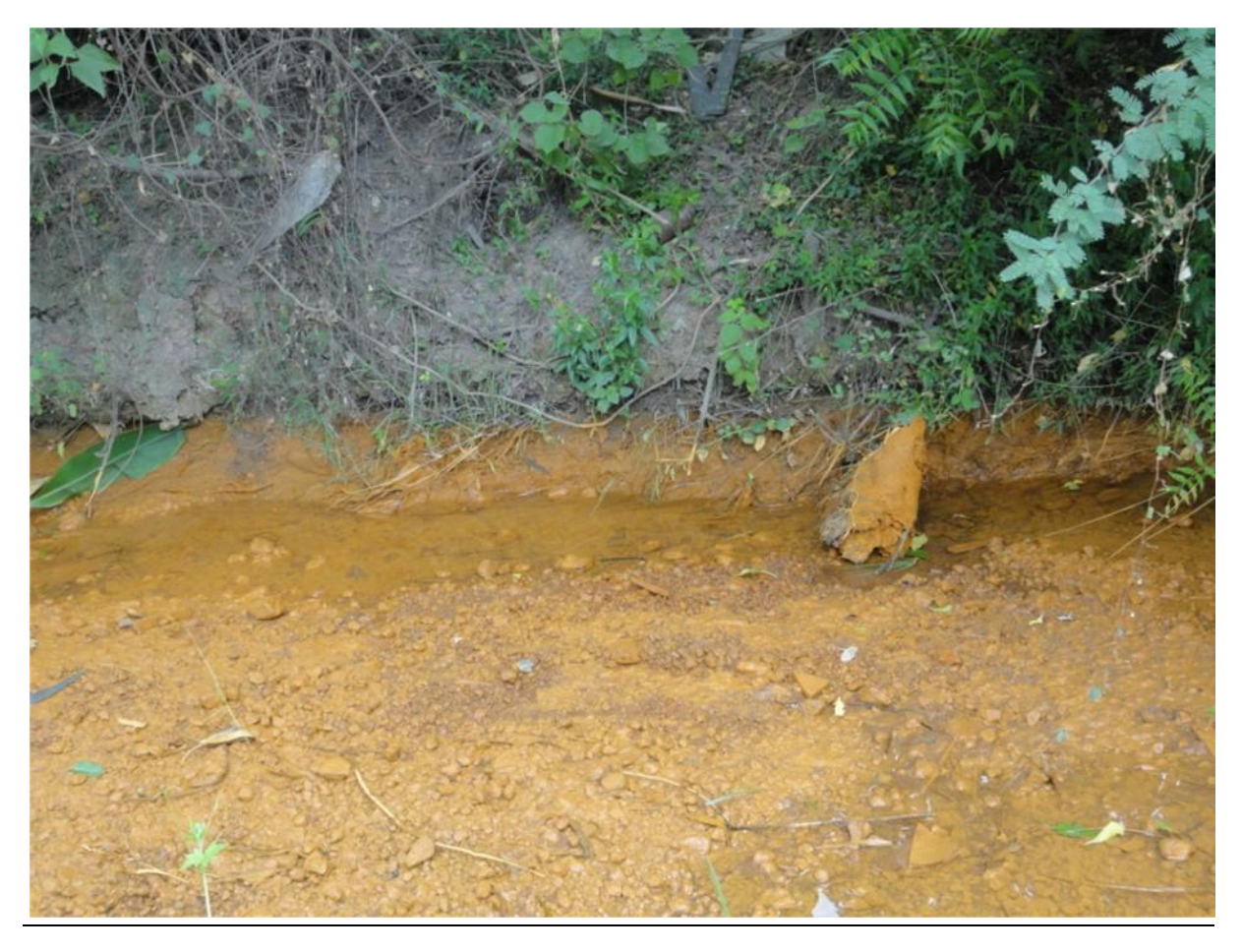
Figure 7: Photograph showing discoloration of local drain after receiving mine drain water from Neyveli Lignite mines.

Neyvelli has also been the site of that not so rare occurrence, rather, one that takes place with an alarming frequency in case of Indian thermal power plants – the ash pond breach which pours thousands of tons of ash into the surroundings, damaging houses, fields and contaminating water systems.