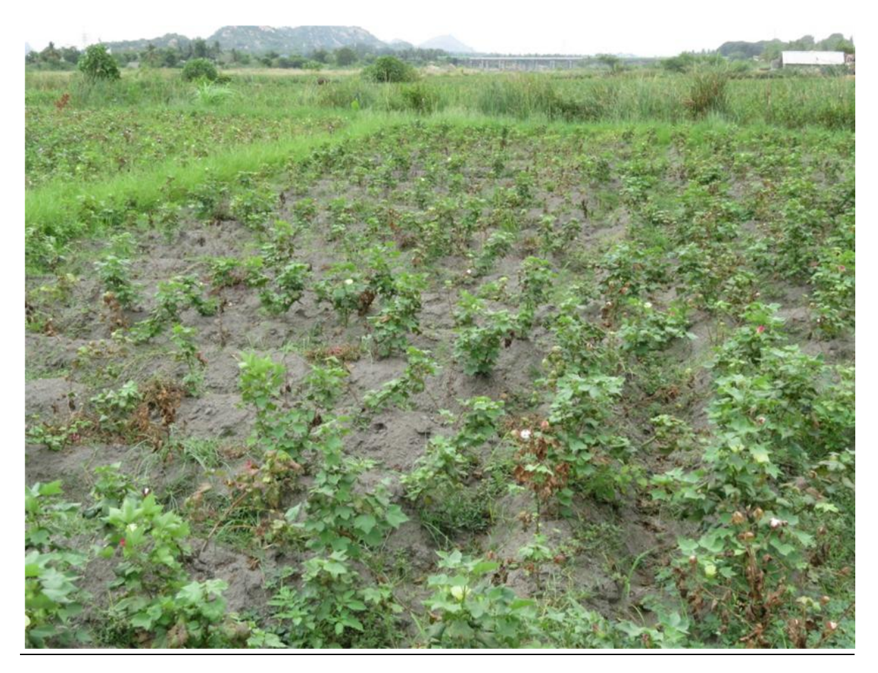
Figure 6: Photograph showing fields on the bank of river Cauvery affected due to ash settlement from ash of Mettur thermal power station ash pond leaked into local water channel.

In Neyvelli , (again, not a coastal location), we saw lignite mines and thermal power station. The mine drainage is being pumped into channels and being delivered to fields for irrigation purposes. This mine drainage has left strong discolouration in the channels, indicating presence of contaminants. Local people also reported that when the channels supplied coloured water (yellow coloured, or black, with coal dust), they got much lesser yields.