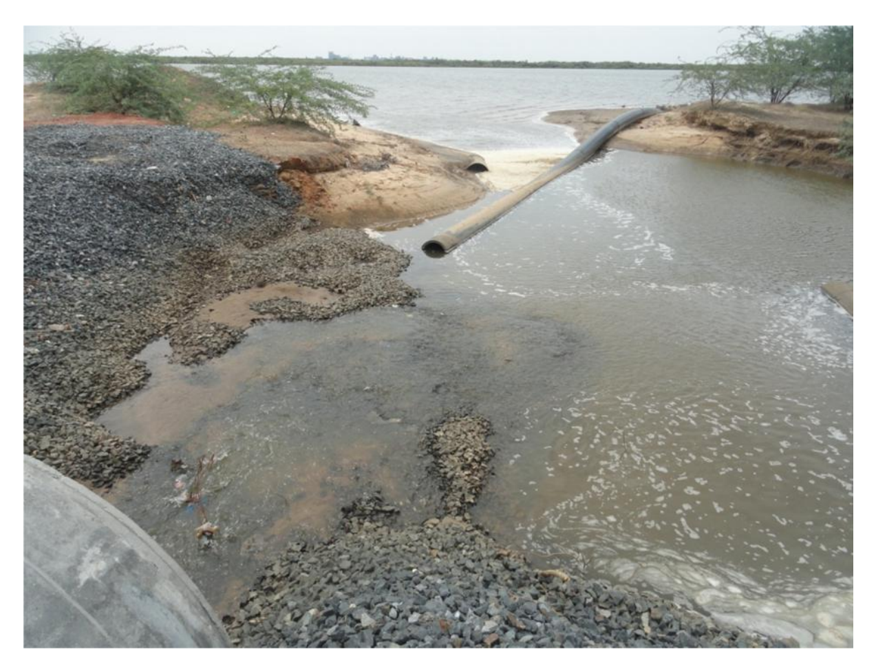
Figure 13: Photograph showing waste water pipeline of thermal power stations discharging effluents into Kandeleru creek.

The same problem was reported by people of the village Krishnapattanam, where there are 700 fishing families, but their fishing has been badly affected due to their access to sea being severely restricted, and the dredging that has affected their catch in the Kandeleru creek. They also reported, as did people from Gummaldibba, about the number of palmolin factories and the leakage and pollution from these factories into the creek, which too was affecting the fishing as per the villagers.