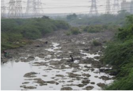
Figure 4: Photograph showing ash from the North Chennai TPS dumped in Buckingham canal next to the gate of plant. Smaller picture shows another view of the Buckingham canal in front of the NC TPS, clogged with ash. Note the fisherman fishing for mussels.