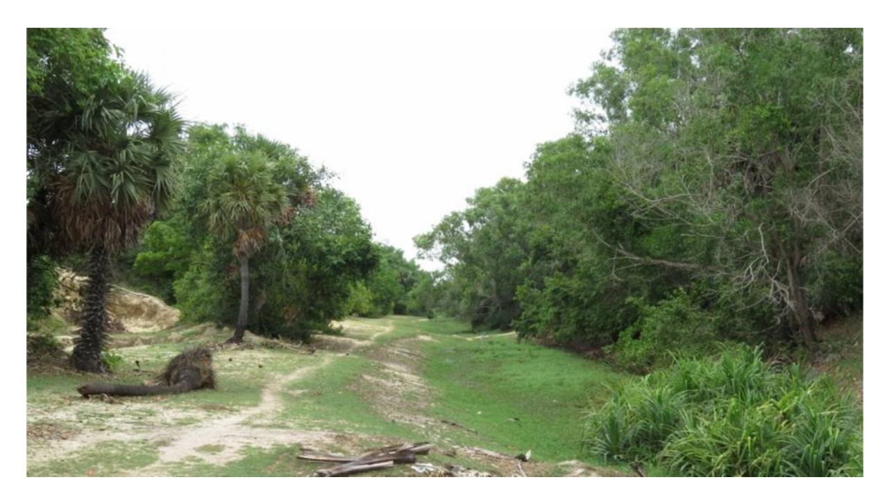
Figure 17: Photograph showing well forested sand dunes near the coast where the conveyer belt of upcoming 4000 Cheyyur UMPP will cross through this area.