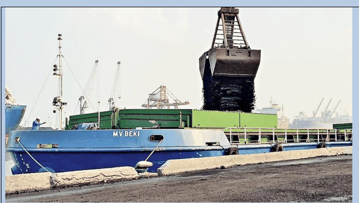
Cargo vessel to transport coal getting loaded at Haldia Dock Complex.

The vessel MV Maheshwari carrying 53 TEUs of container cargo sailed from Haldia (National Waterway-1) to Pandu port (National Waterway-2) via Indo-Bangladesh Protocol Route (which includes part of National Waterway-97). The cargo belonged to Adani wilmar and Hindustan Petrochemicals. Along with the vessel, two more vessels sailed from Haldia to Pandu Port carrying 1200 tonnes coal for Star Cement Plant in Sonapur. This 'largest container movement,' however, had to face the wrath of cyclone Bulbul on the way. One of the vessel carrying coal got stuck due to inadequate water depth. The vessels were sailed further with the help of a dredger. These vessels were destined to reach the destination in 12 days; however, according to the news reports, the vessels were, almost a month after, 200 km from their destination. Read more at