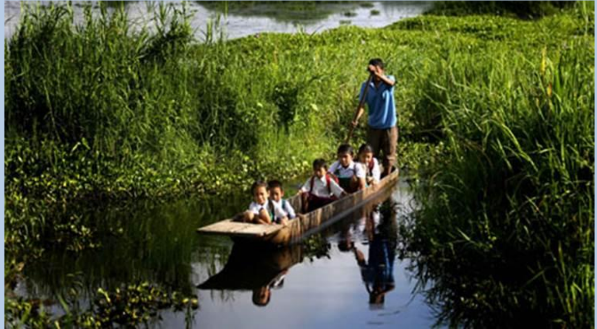
Loktak Lake at Manipur.

However, environmental activists and the fishing communities residing around the Loktak Lake have strongly objected to the Inland waterway project claiming that it will destroy the lake's biodiversity and the livelihood of fisherfolks.