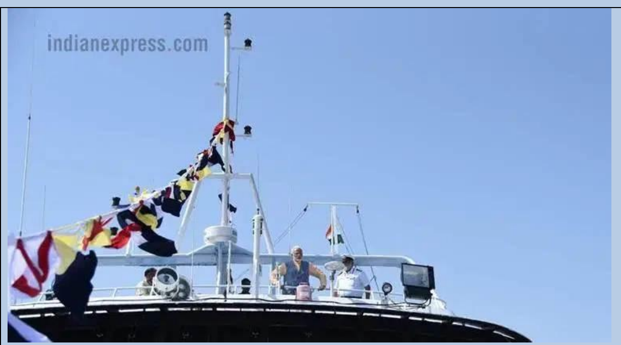
Prime Minister, Shri Narendra Modi during the launch of the Phase-I of this ferry service between Ghogha and Dahej in 2017.

A month after the service was opened, the Ro-Ro ferry vessel transporting people between Ghogha in Saurashtra and Dahej in South Gujarat came to a standstill mid-sea and was sailed further with the help of a tug boat. See <u>https://www.business-standard.com/article/pti-stories/ro-ro-ferry-vessel-stuck-mid-sea-towed-to-safety-by-tugboats-118112101103_1.html</u>